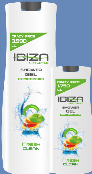
IBSGFC750 750ml IBSGFC200 200ml

•Fresh Clean: Inspired by the many moods of beautiful Spanish Ibiza amidst the Mediterranean Sea, this addition to the Amatory 114 collection, is fun, summery, young and playful. The Ibiza range is made of high quality natural ingredients, is paraben free, and intensely refreshing. Fresh Clean is the fruity and citrusy version that cleanses and moisturizes your skin while keeping you refreshed.