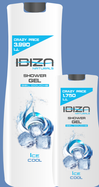
IBSGIC750 750ml IBSGIC200 200ml

INGREDIENTS: Aqua, Sodium Laureth Sulfate, Cocamidopropyl Betaïne, PEG-7 Glyceryl Cocoate, Coco Glucoside, Styrene/Acrylates Copolymer, Glycol distearate, Laureth-4, Cocamide DEA, Sodium Chloride, Perfume, Polyquaternium-7, Propylene Glycol, Butylene Glycol, Chamomilla Recutita (Matricaria) Flower Extract, Glucose Bisabolol, Citric Acid, Methylchloroisothiazolinone, Methylisothiazolinone, Tetrasodium EDTA, Alpha-isomethyl ionone, Benzyl salicylate Butylphenyl methylpropional, Citronellol, D-Limonene, Hexyl cinammal, Linalool