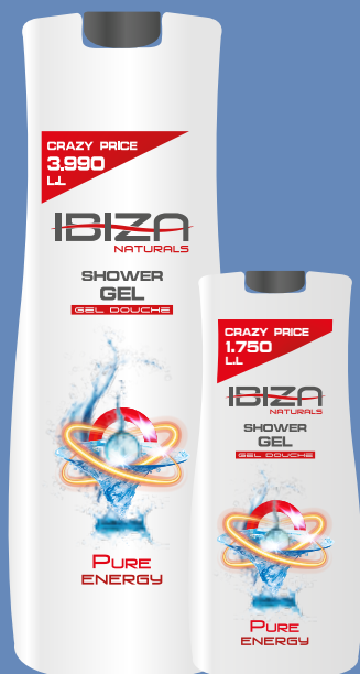
IBSGPE750 750ml IBSGPE200 200ml

INGREDIENTS: Aqua, Sodium Laureth Sulfate, Cocamidopropyl Betaïne, PEG-7 Glyceryl Cocoate, Coco Glucoside, Styrene/Acrylates Copolymer, Glycol distearate, Laureth-4, Cocamide DEA, Sodium Chloride, Perfume, Polyquaternium-7, Propylene Glycol, Butylene Glycol, Chamomilla Recutita (Matricaria) Flower Extract, Glucose, Bisabolol, Citric Acid, Methylchloroisothiazolinone, Methylisothiazolinone, Tetrasodium EDTA, Benzyl salicylate, Citronellol, Coumarin, Geraniol, Hexyl cinammal, Linalool, Alpha-isomethyl ionone, Butylphenyl methylpropional