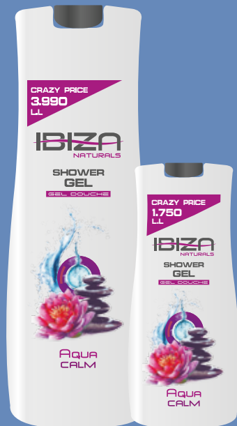
IBSGAC750 750ml IBSGAC200 200ml

•Aqua Calm: Inspired by the many moods of beautiful Spanish Ibiza amidst the Mediterranean Sea, this addition to the Amatory 114 collection, is fun, summery, young and playful. The Ibiza range is made of high quality natural ingredients, is paraben free and intensely refreshing. Aqua Calm is the peaceful and zen version that cleanses and moisturizes your skin while balancing your mood.