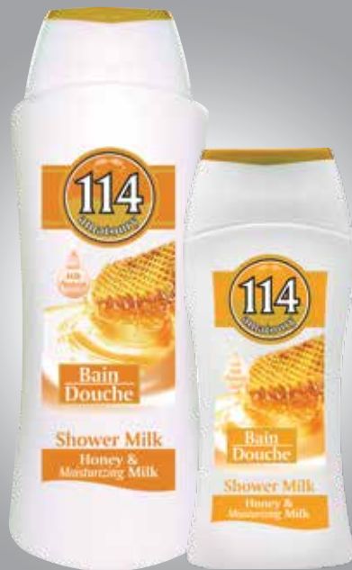
BDHMM750NP 750ml BDHMM250NP 250ml

• Honey & Moisturizing Milk: An intensely moisturizing addition to the Bain Douche line of shower gels, our shower milk features a luxurious milky texture and a deep hydrating function. Made from top quality ingredients we handpick from our European suppliers, this shower milk will surprise you with its rich foam and everlasting fragrance. Concentrated in milk proteins and infused with honey, both known for their moisturizing properties, our shower milk leaves your skin moisturized and heavenly scented for hours.