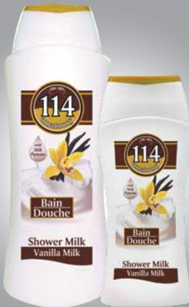
BDVM750NP 750ml BDVM250NP 250ml

INGREDIENTS: Aqua, Sodium Laureth Sulfate, Cocamidopropyl Betaïne, Lauryl Glucoside, PEG-7 Glyceryl Cocoate, Cocamide DEA, Glycerin, Sodium Chloride, Perfume, Divinyldimethicone/Dimethicone Copolymer, C1213- Pareth-23, C1213- Pareth-3, Styrene/Acrylates Copolymer, Honey (Mel), Pentylene Glycol, PEG-40 Hydrogenated Castor Oil, Trideceth-9, Sine Adipe Lac, Decylene Glycol, 1,2 Hexanediol, Polyquaternium-7, PEG-3 Distearate, Methylchloroisothiazolinone, Methylisothiazolinone, Tetrasodium EDTA, Benzyl Benzoate, Hexyl Cinnamal, Amyl Cinnamal, Limonene. MAY CONTAIN: CI 19140, CI 16035, CI 45190, CI 17200, CI 42090.